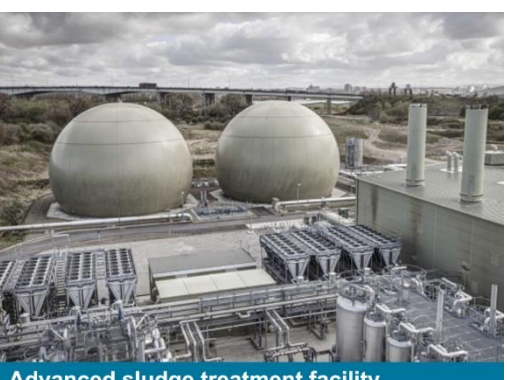
Advanced sludge treatment facility

United Utilities also plan to build an advanced sludge treatment process to serve much of the North West that will produce renewable gas which can be injected into the National Gas Grid or used to generate renewable electricity.