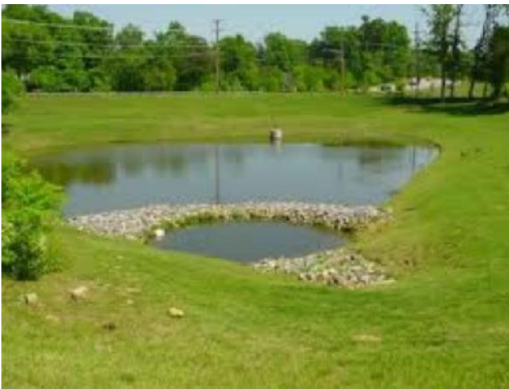
PHOTO OF STONE EMBANKMENT SEDIMENT FOREBAY