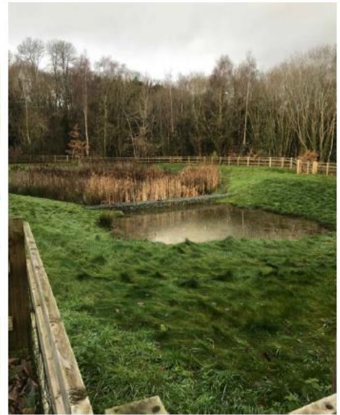
PHOTO OF CONCRETE SEDIMENT FOREBAY